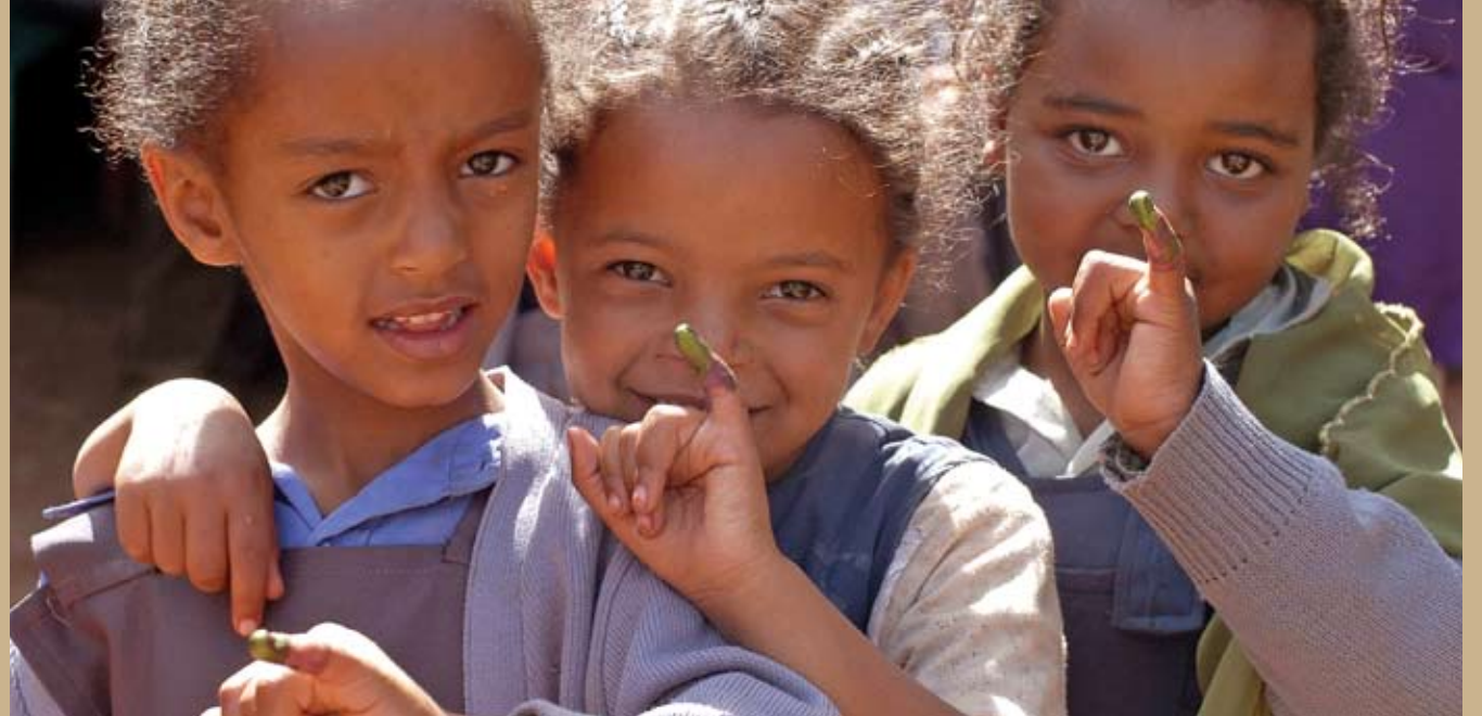
Girls show fingers marked with indelible ink after receiving the oral polio vaccine funded by Rotary | Addis Ababa, Ethiopia