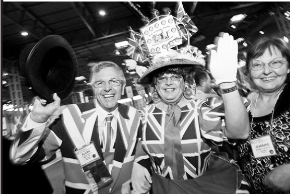
Convention-goers attend the opening of the House of Friendship during the 2009 RI Convention in Birmingham, England. (Rotary Images/Alyce Henson)

Ban Ki-moon called Rotary the heart and soul of the worldwide polio eradication effort and pledged the UN's continued cooperation and support.